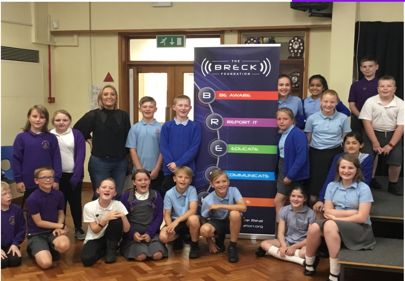
Year 5 pupils from New Road and Park Lane working with the Breck Foundation