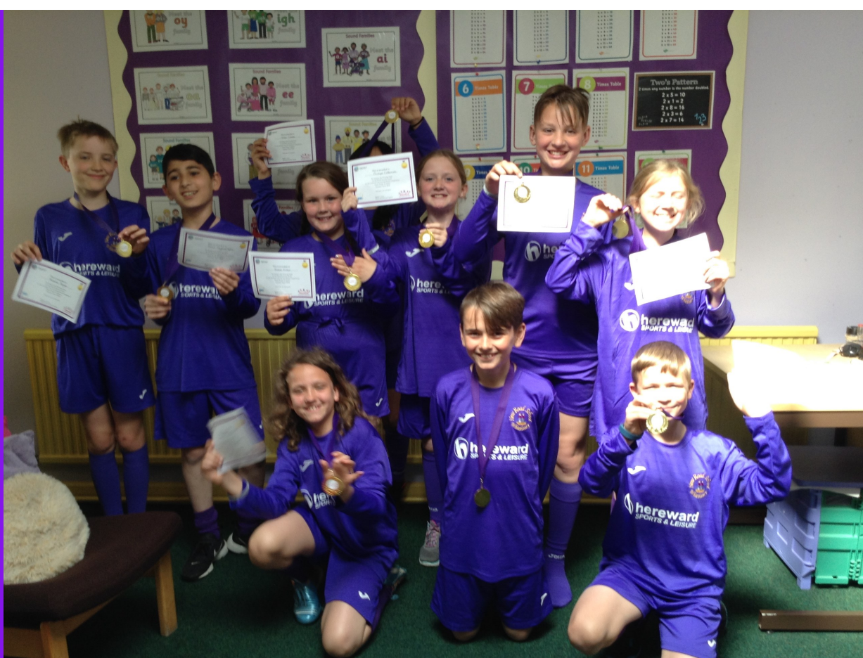
Sporting Heroes - Our school athletics team did a cracking job at the County Finals. We are so proud of you all!!!