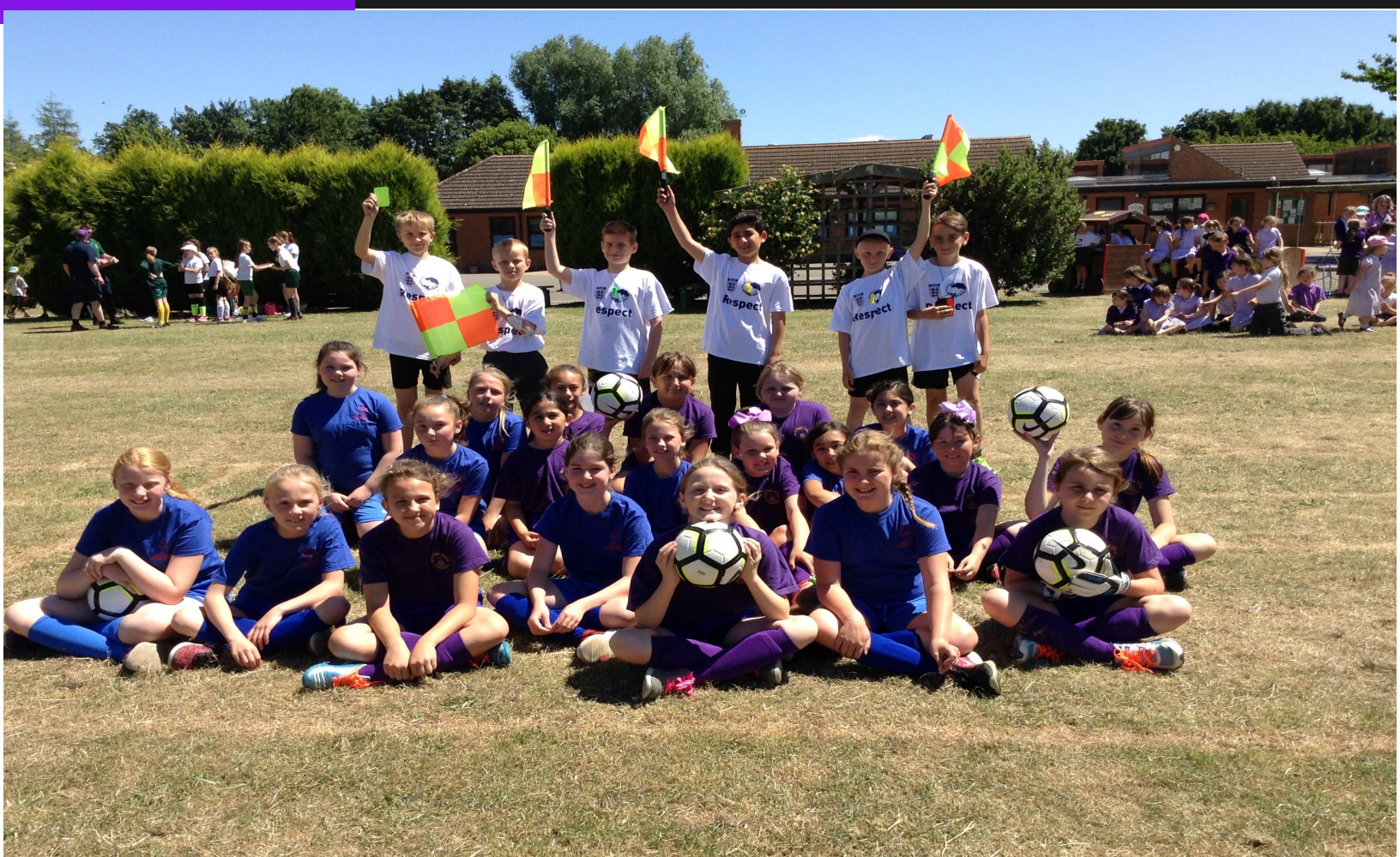
New Road and Park Lane Teams having a rest whilst the referees (Year 6 New Road boys) look on! What a great day of foot-